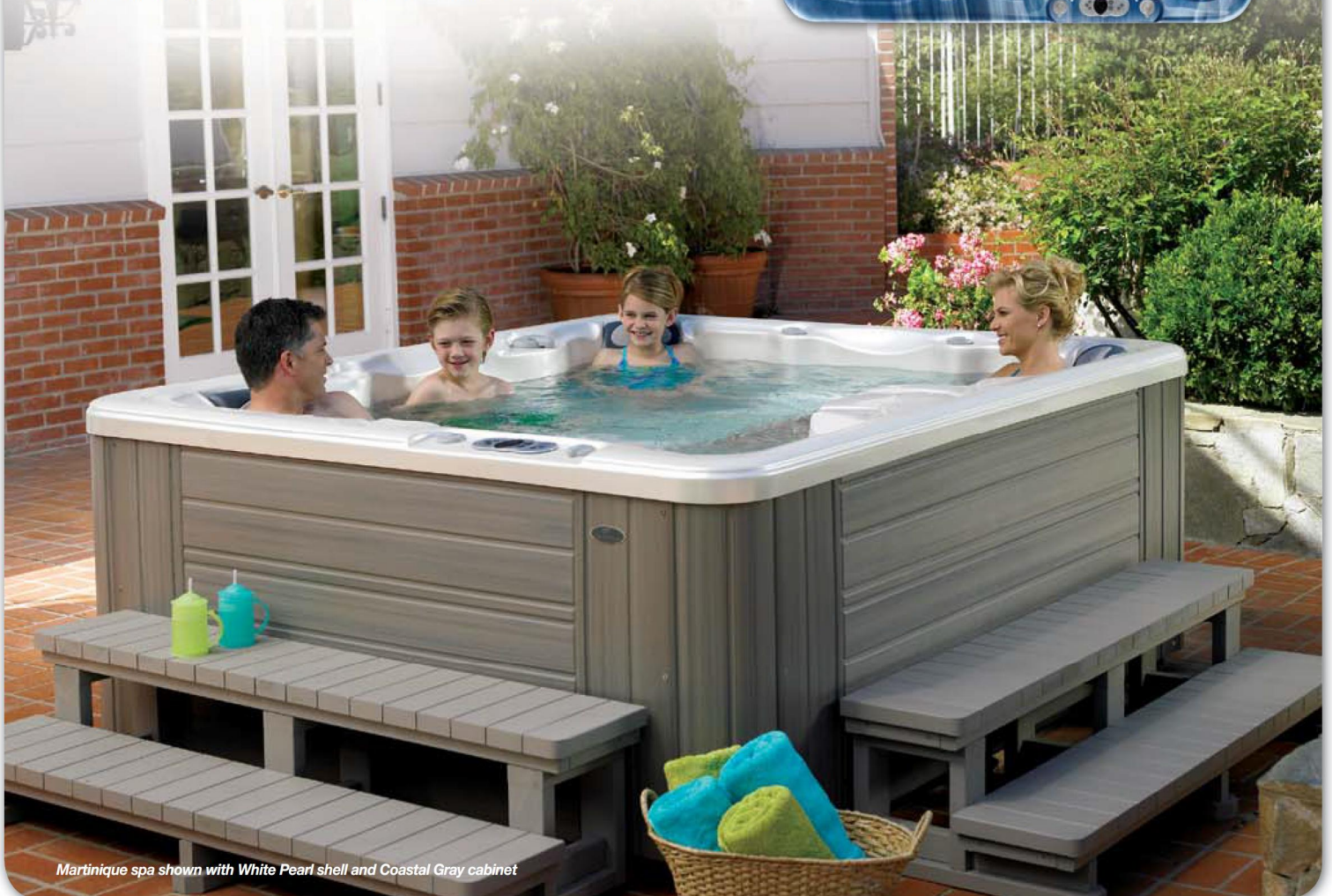
Martinique spa shown with White Pearl shell and Coastal Gray cabinet