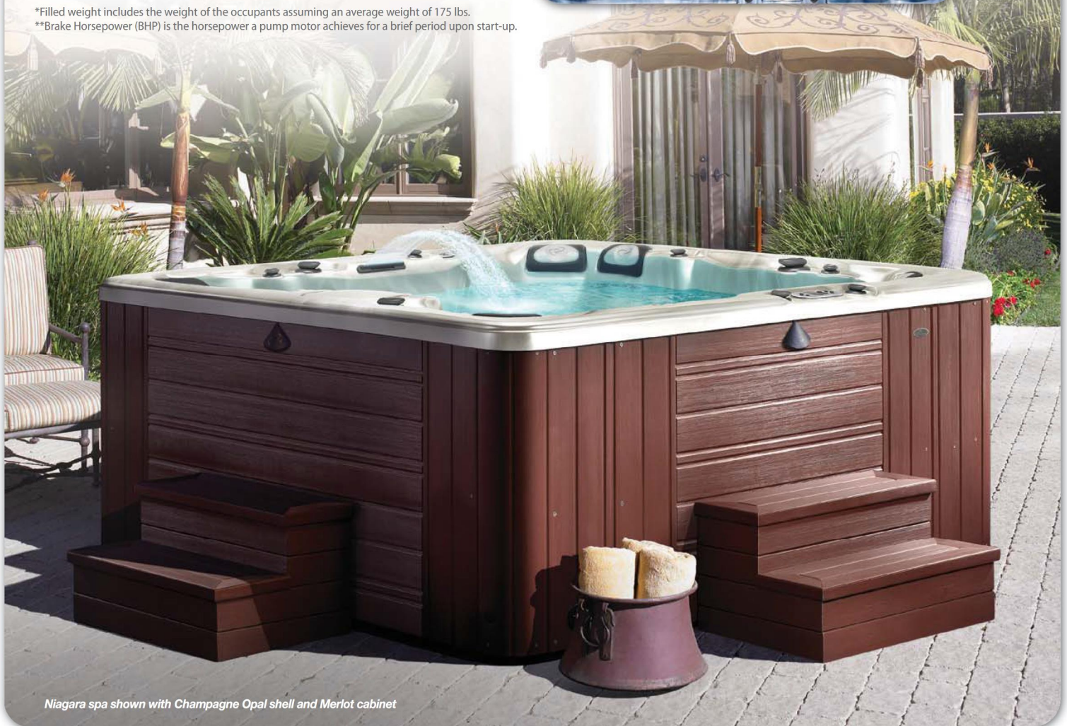
Niagara spa shown with Champagne Opal shell and Merlot cabinet