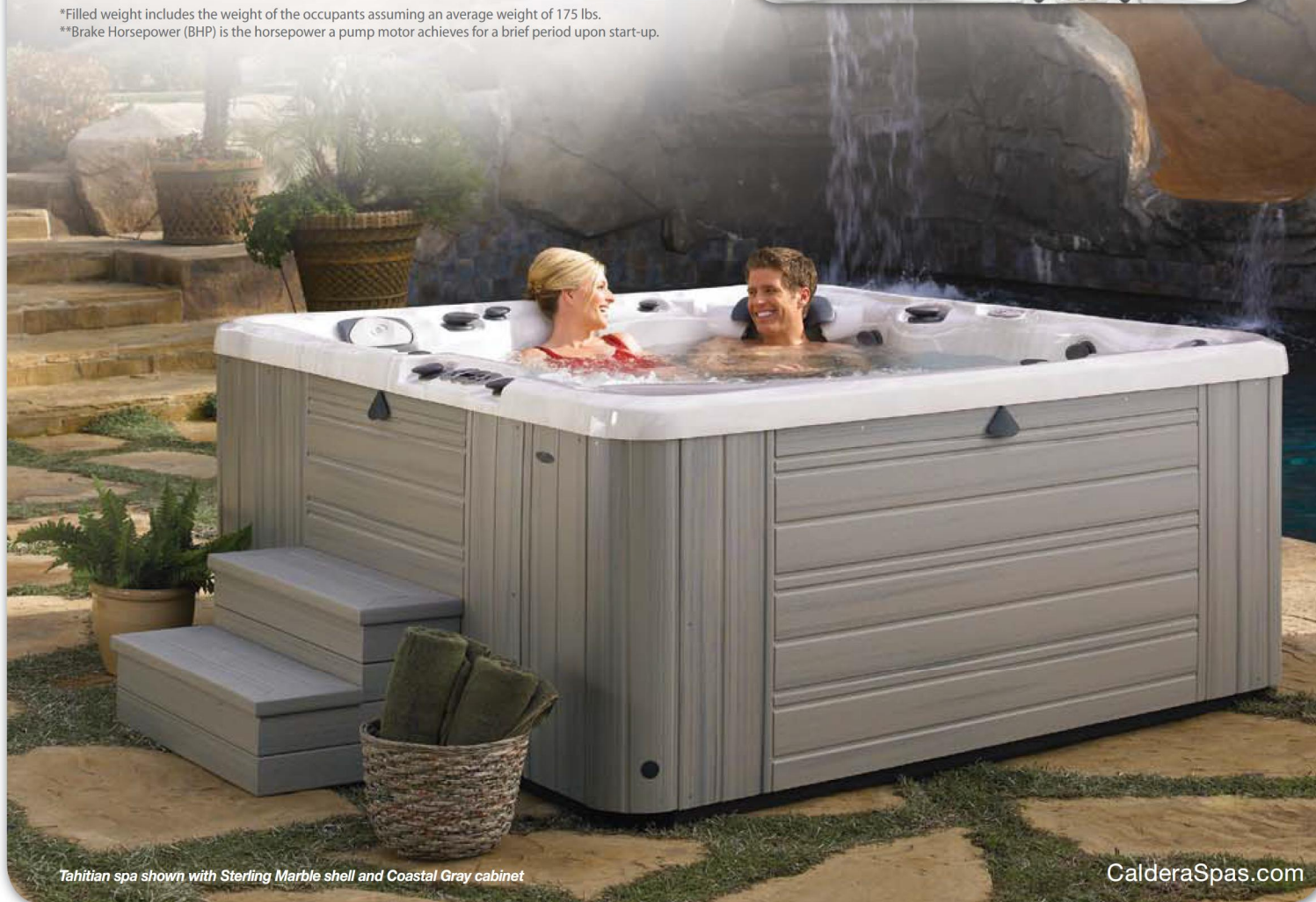
Tahitian spa shown with Sterling Marble shell and Coastal Gray cabinet